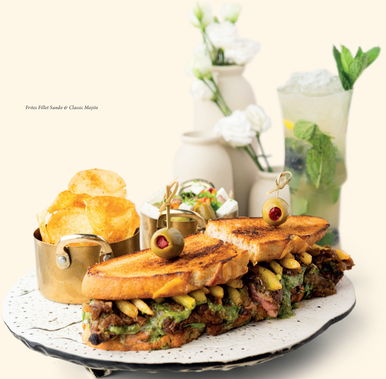
Frites Fillet Sando & Classic Mojito