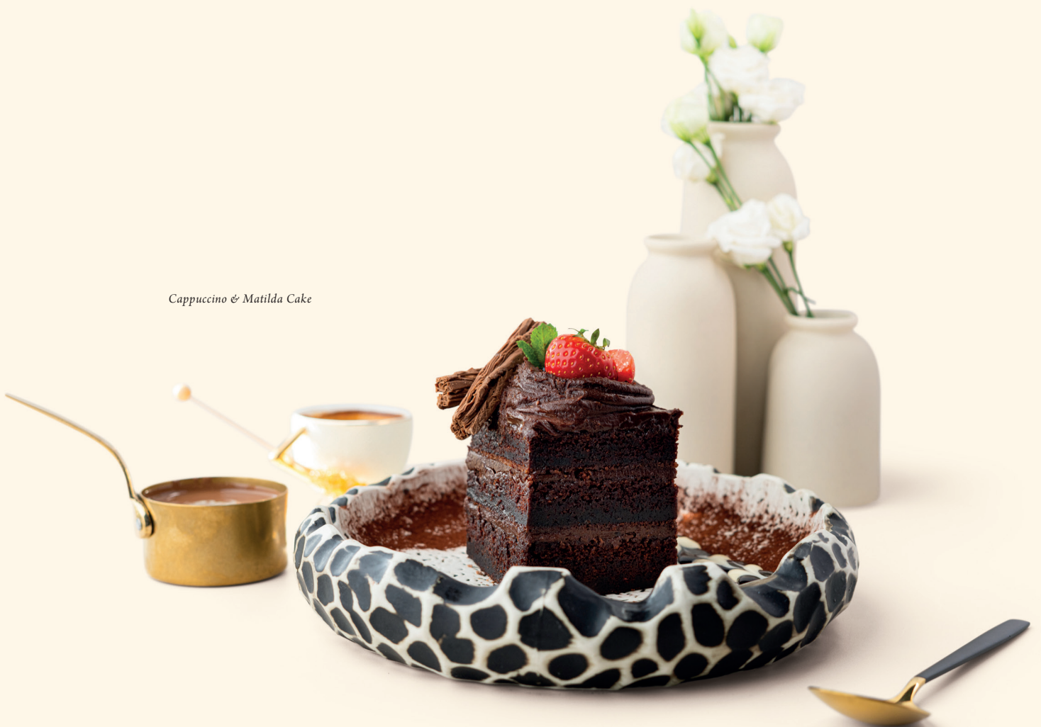
Cappuccino & Matilda Cake