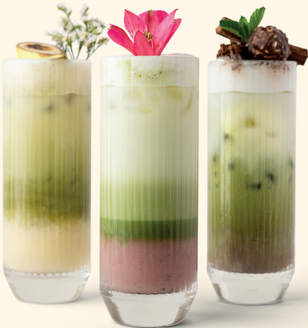
Milk Chocolate & Coconut Iced Matcha