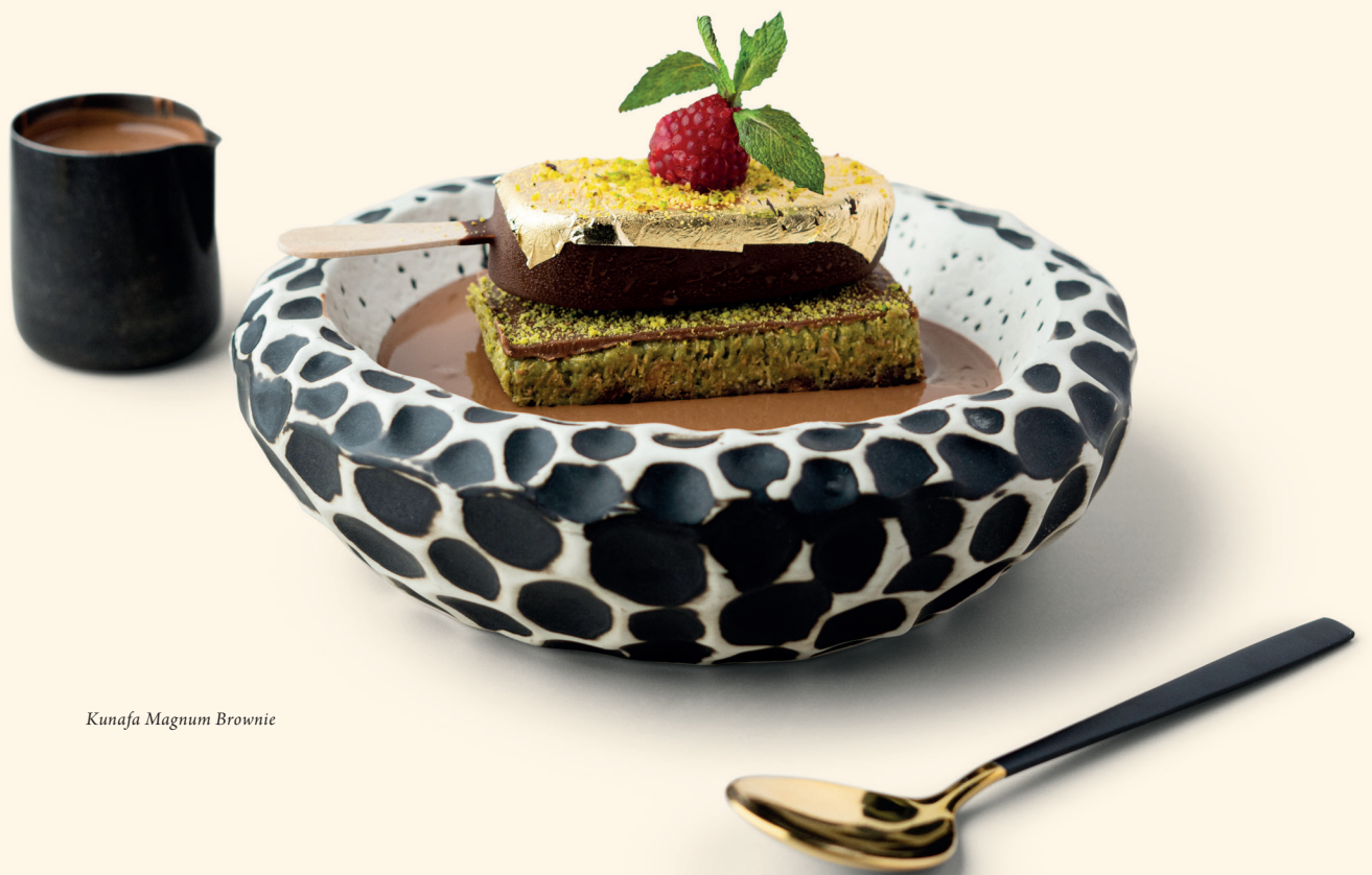
Kunafa Magnum Brownie