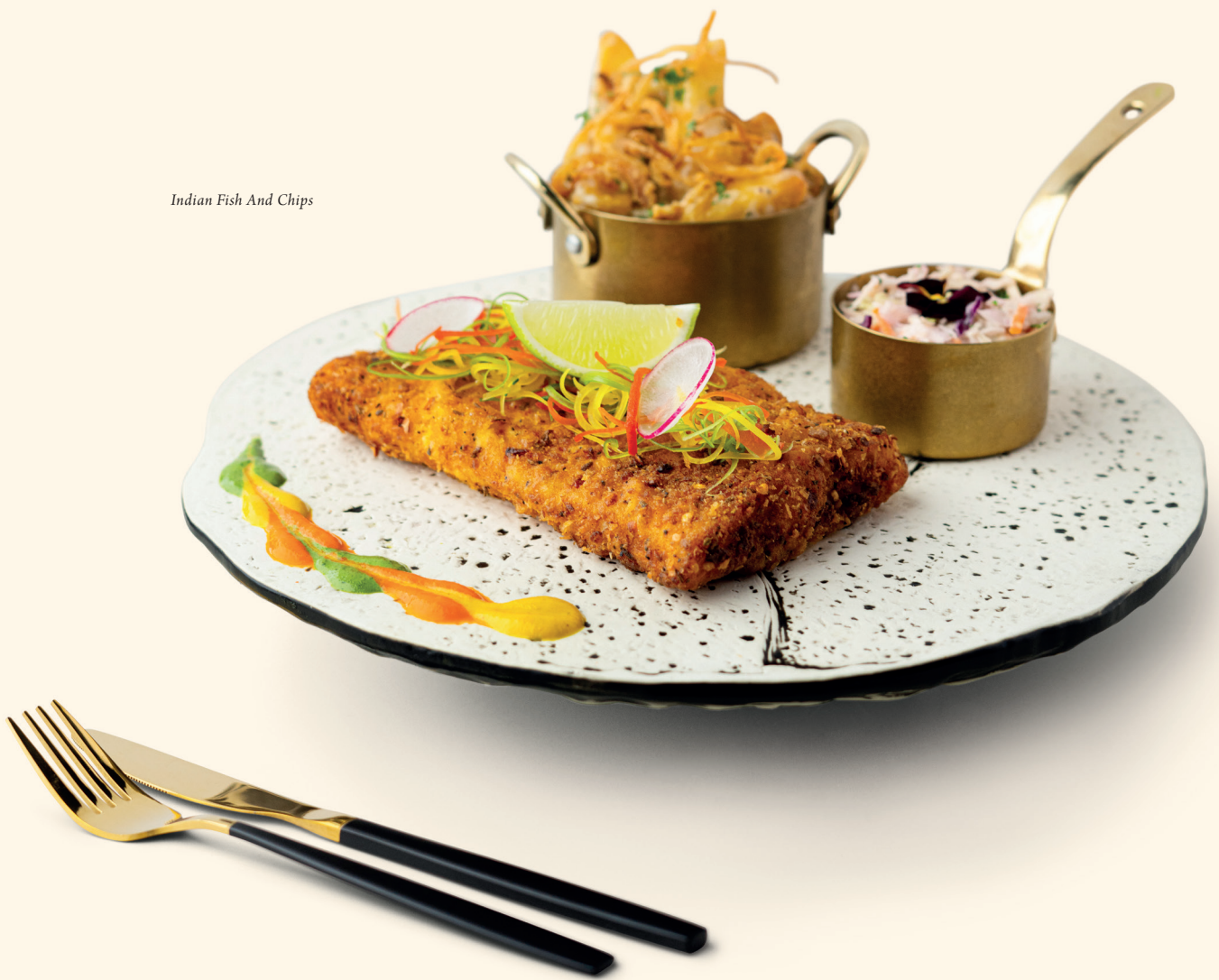
Indian Fish And Chips